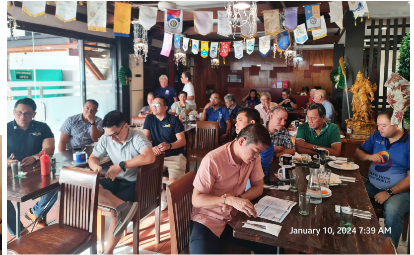
January 10, 2024 7:39 AM