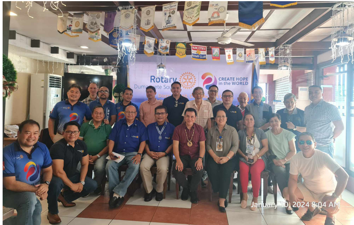
January 10, 2024 8:04 AM