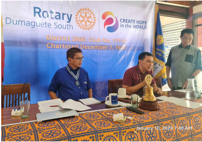
January 10, 2024 7:40 AM